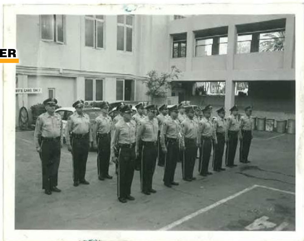
PATROL BUREAU IN SP. MAY 1960

Take a look back in time to spotlight our law enforcement heritage. The APB highlights an image each month.