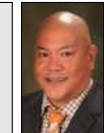
Juvien Galzote Ch. 21: Central Court